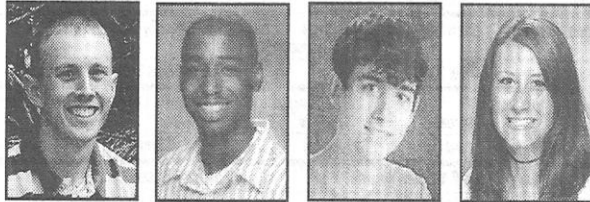
Castles Brown Wenneborg Enlow